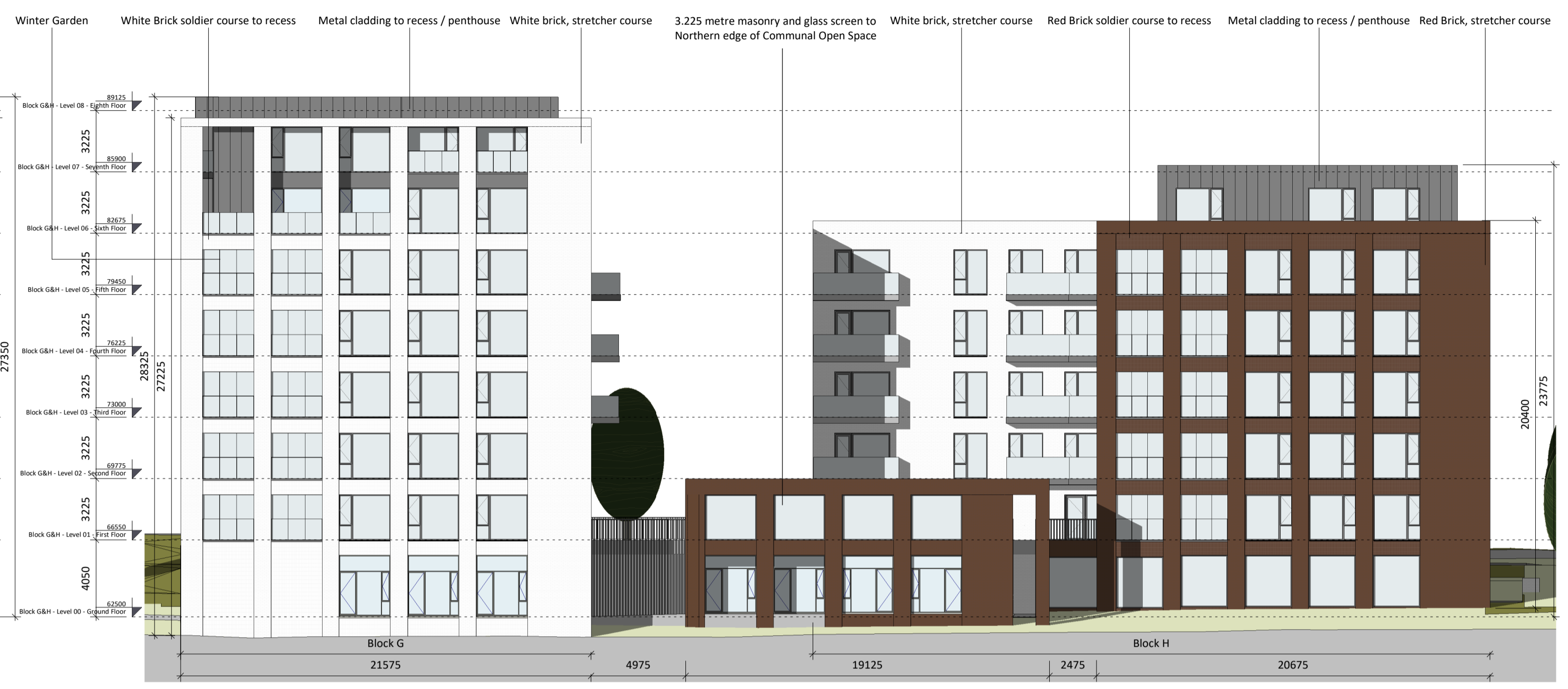
2 Block G&H NW Elevation 1: 200