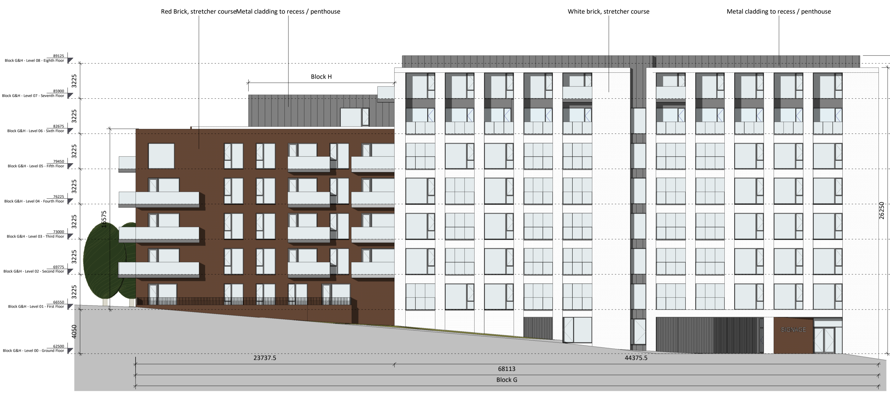
1 Block G&H NE Elevation 1: 200